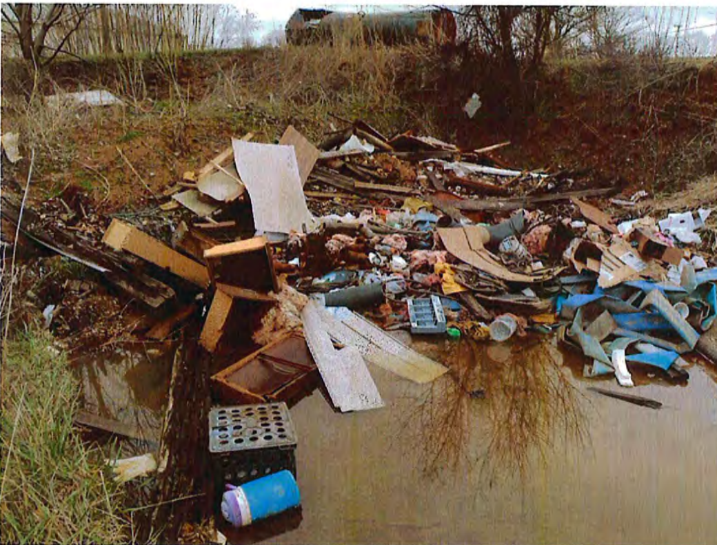
Date: 12/30/2015 Time: 1:00 P.M. Direction: north Exposure #: 002 Comments: evidence of continued open dumping