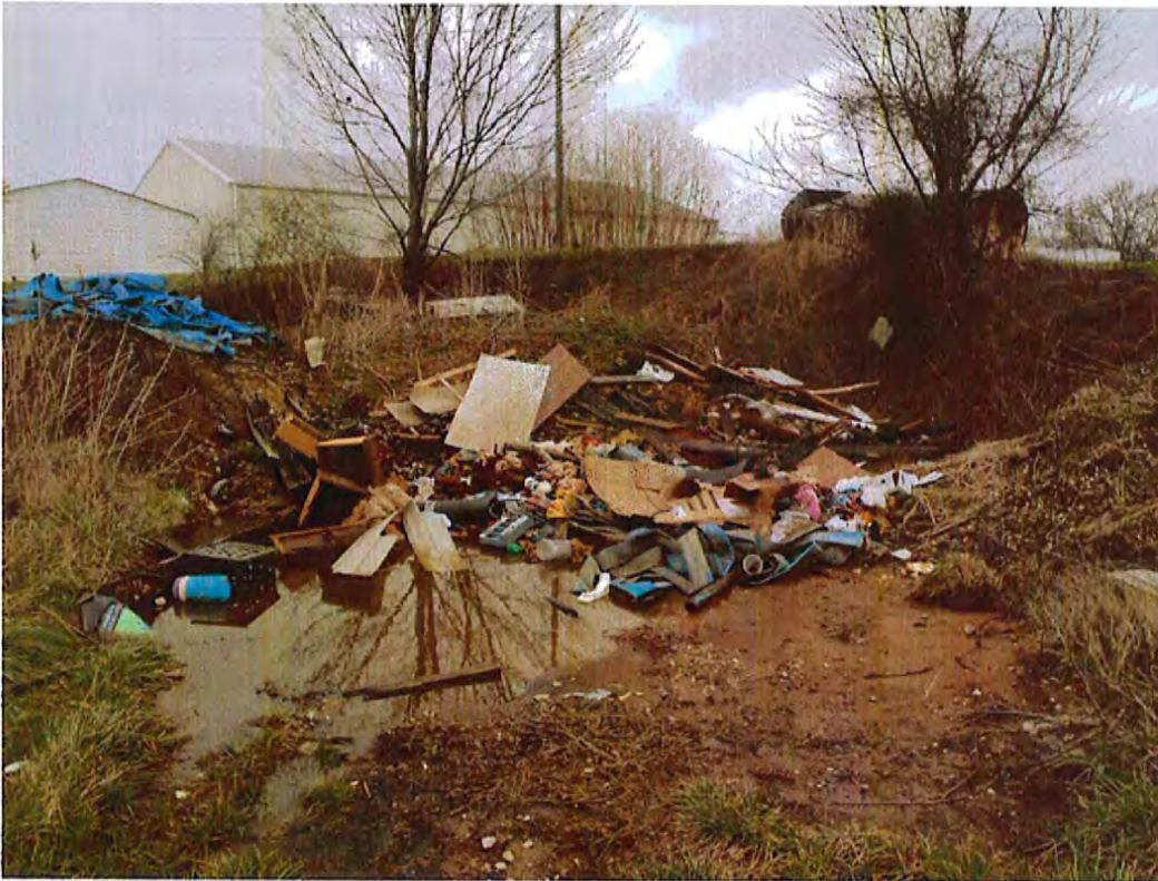
Date: 12/30/2015 Time: 1:00 P.M. Direction: north Exposure #: 001 Comments: evidence of continued open dumping

File Names: 1850205044~12302015-[001-002].jpg