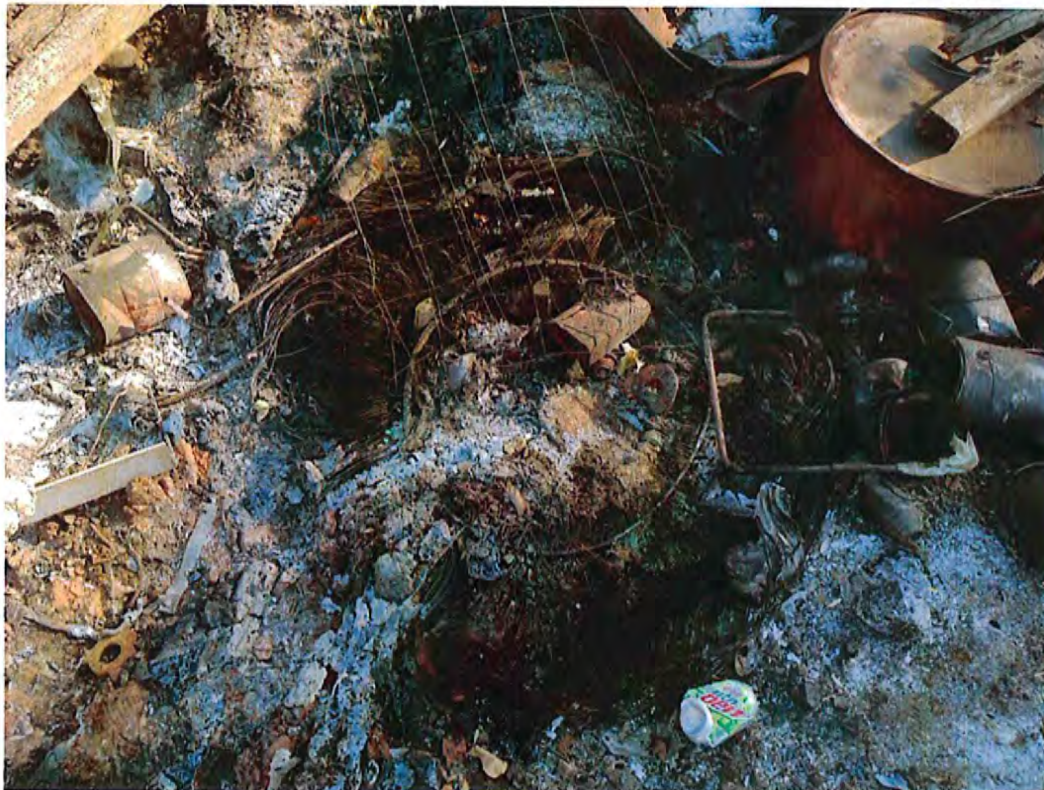
Date: 10/19/2015 Time: 10:34 A.M. Direction: north Exposure #: 002 Comments: evidence of open dumping and open burning of used tires