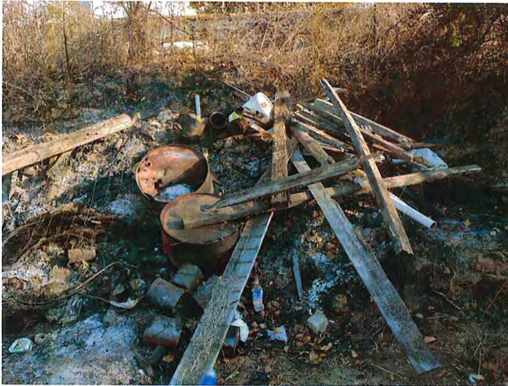
Date: 10/19/2015 Time: 10:34 A.M. Direction: north Exposure #: 001 Comments: evidence of open dumping and open burning of litter (trash) and demolition debris

File Names: 1850205044~10192015-[001-003].jpg